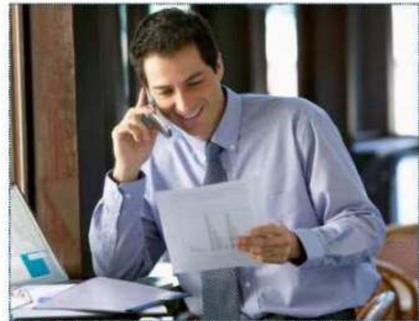
We all have the obligation to be accurate and ethical with Verint's finances and financial records.

The retention and proper disposal of records and data shall be in accordance with Verint's policies and procedures, as well as applicable legal requirements.