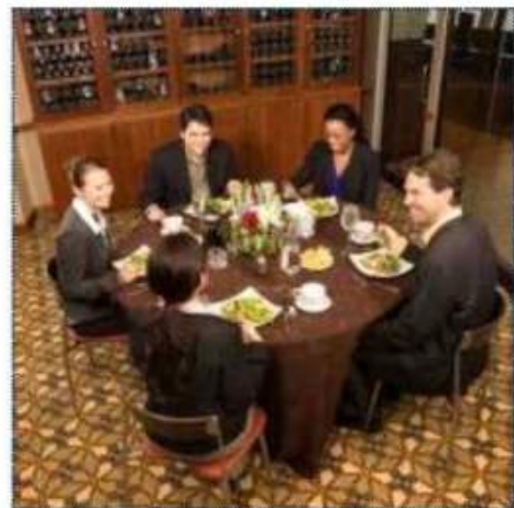
We give or receive gifts and entertainment only as a business courtesy and not to influence business decisions.

The occasional exchange of favors, gifts, or entertainment of nominal value with employees of a nongovernmental entity is acceptable, unless the recipient's employer forbids the practice. If you are unsure whether an entity is government owned, contact your regional Legal Department. Remember, any courtesy you extend must always comply with Verint policies and the policies of the recipient's organization; those with whom we do business should understand our policy, as well.